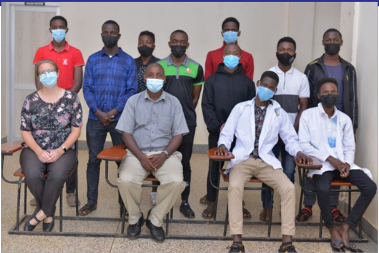
Department of Physiotherapy