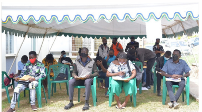
Registration Waiting area