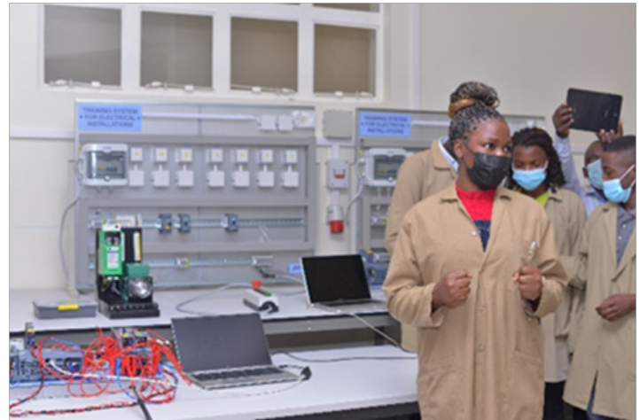
Students presentig to the delegates