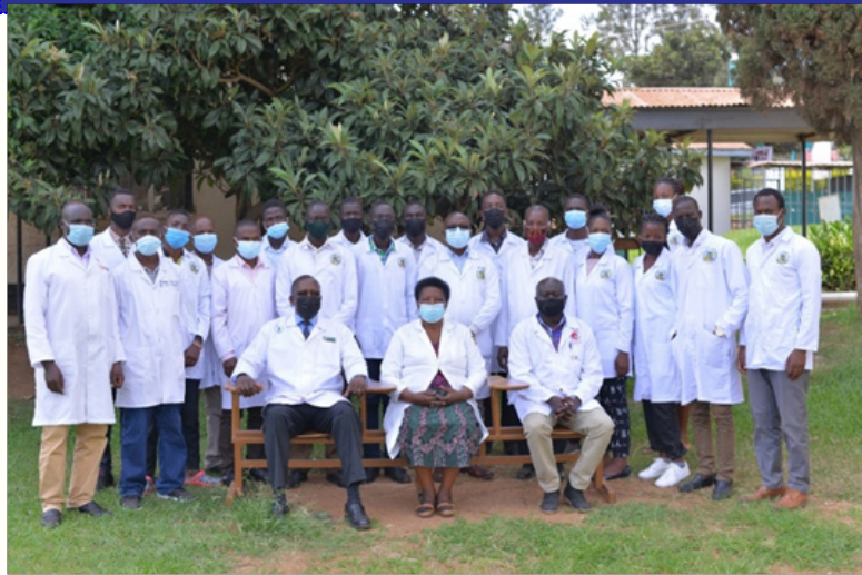
Department of Medical Laboratory Science