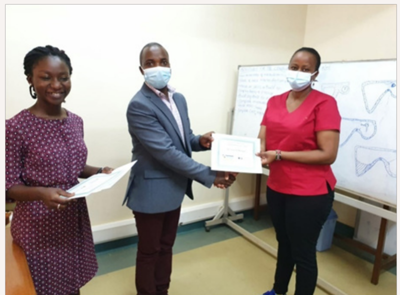
Deputy Dean officiating at closing ceremony and handing out certificates