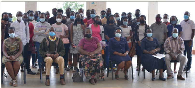
Faculty of Interdisciplinary studies