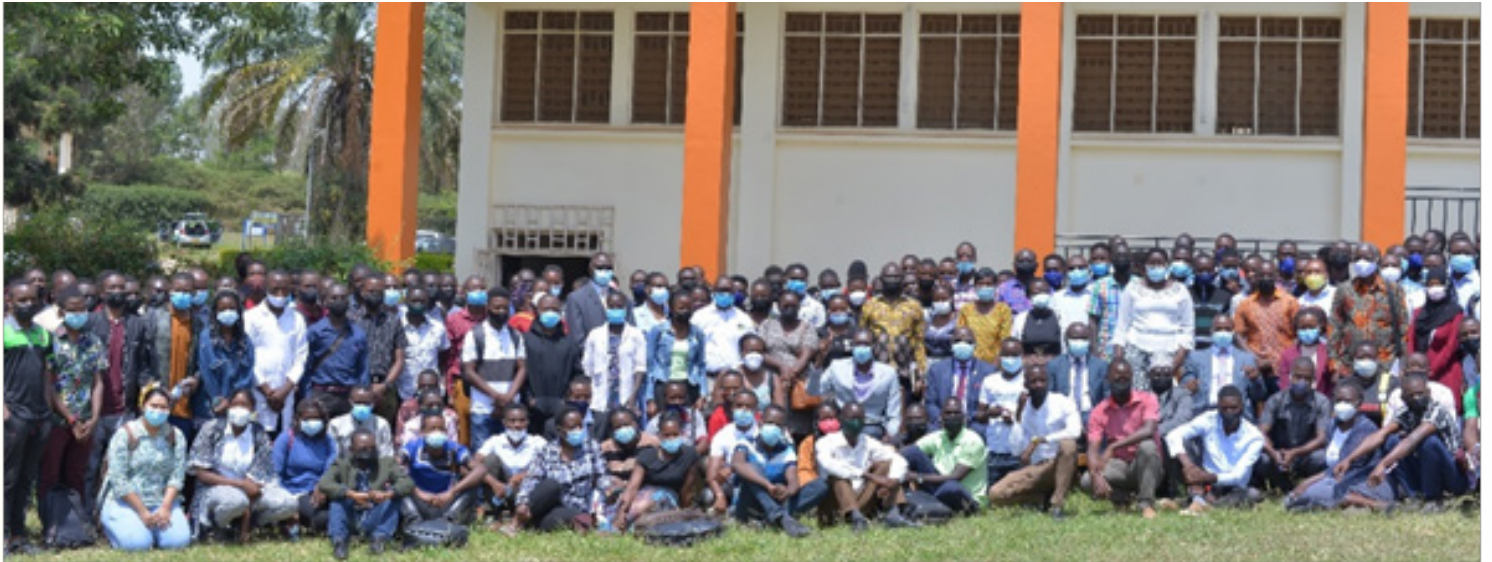
Faculty of Medicine