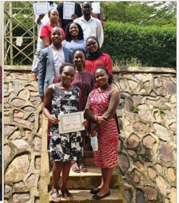
Attendees, facilitators, and deputy dean