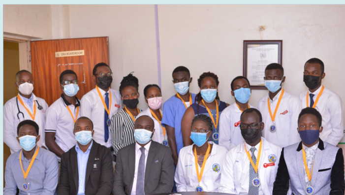
The entire team after receiving their medal